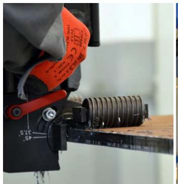
Plate facing-off (option)