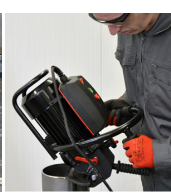
Pipe beveling (option)